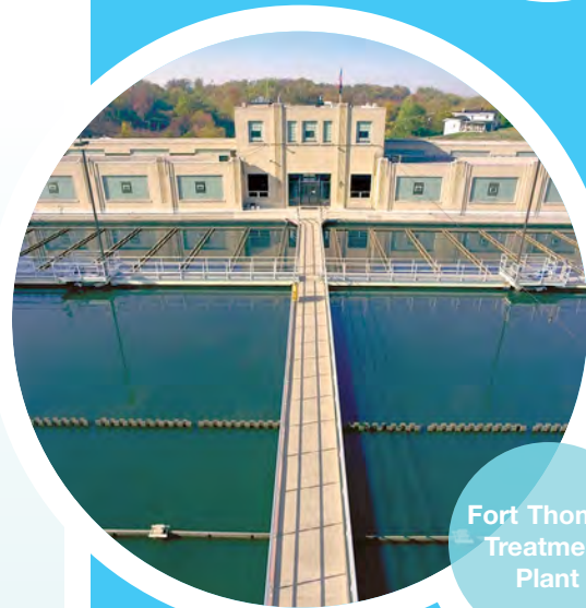
Fort Thomas Treatment Plant