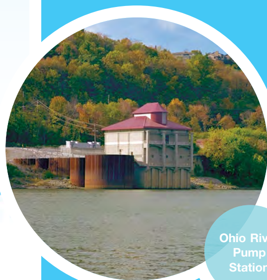
Ohio River Pump Station

The surface water sources for NKWD are the Ohio and Licking rivers. A source water assessment has been completed on each. The following is a summary of the susceptibility analysis that is part of the source water assessment. Several areas of concern are related to the extensive development of transportation infrastructure, the potential for spills, high degree of impervious cover and polluted runoff. Areas of row crops and urban and recreational grasses introduce the potential for herbicide, pesticide, and fertilizer use – possible nonpoint source contaminants. Bridges, railroads, ports, waste handlers or generators, and Tier II hazardous chemical