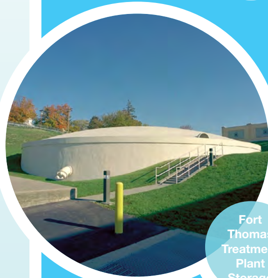
Fort Thomas Treatment Plant Storage